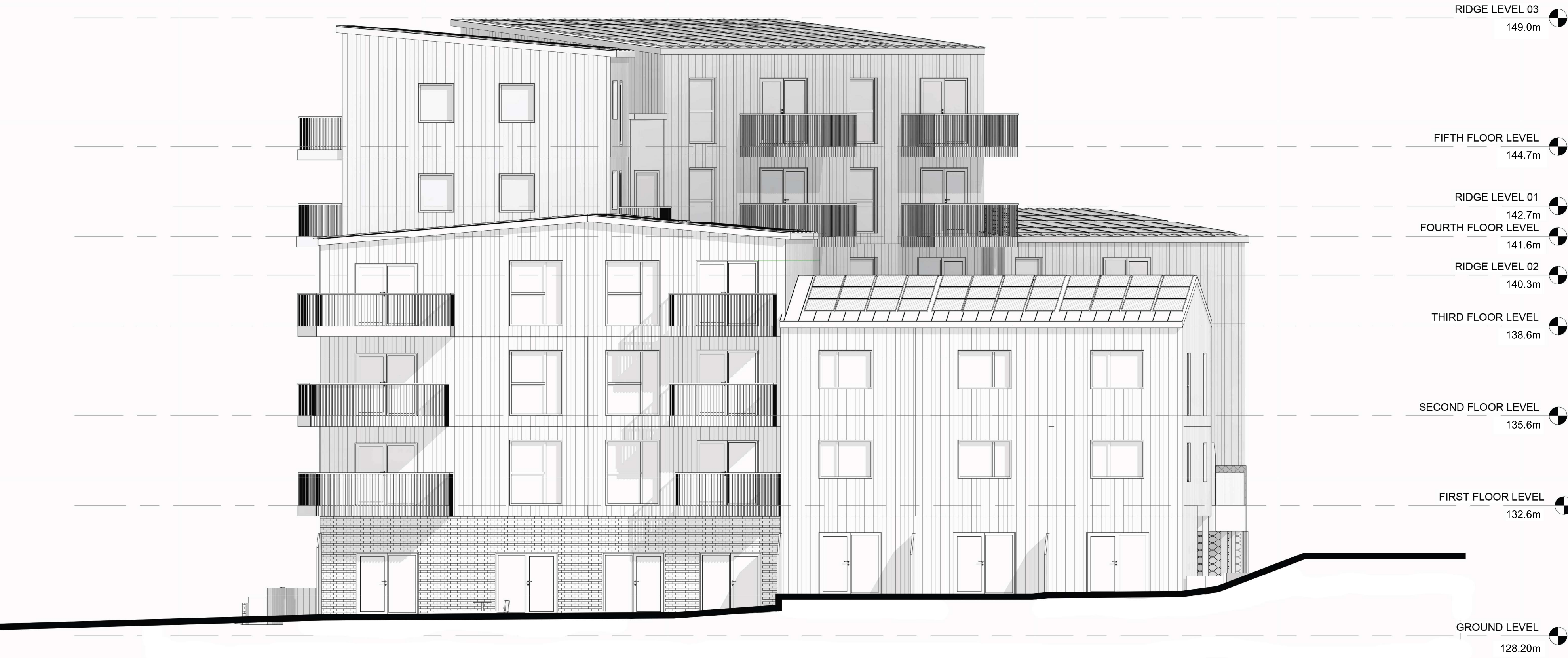
1 ELEVATION A 1 : 100