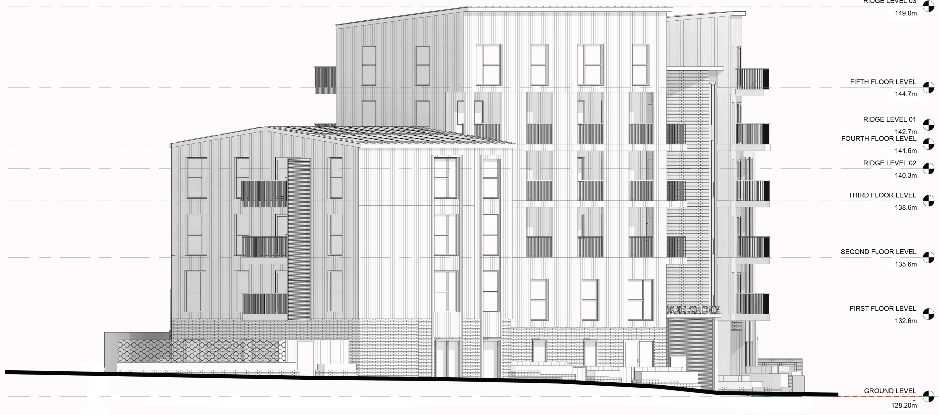
2 ELEVATION C 1 : 100